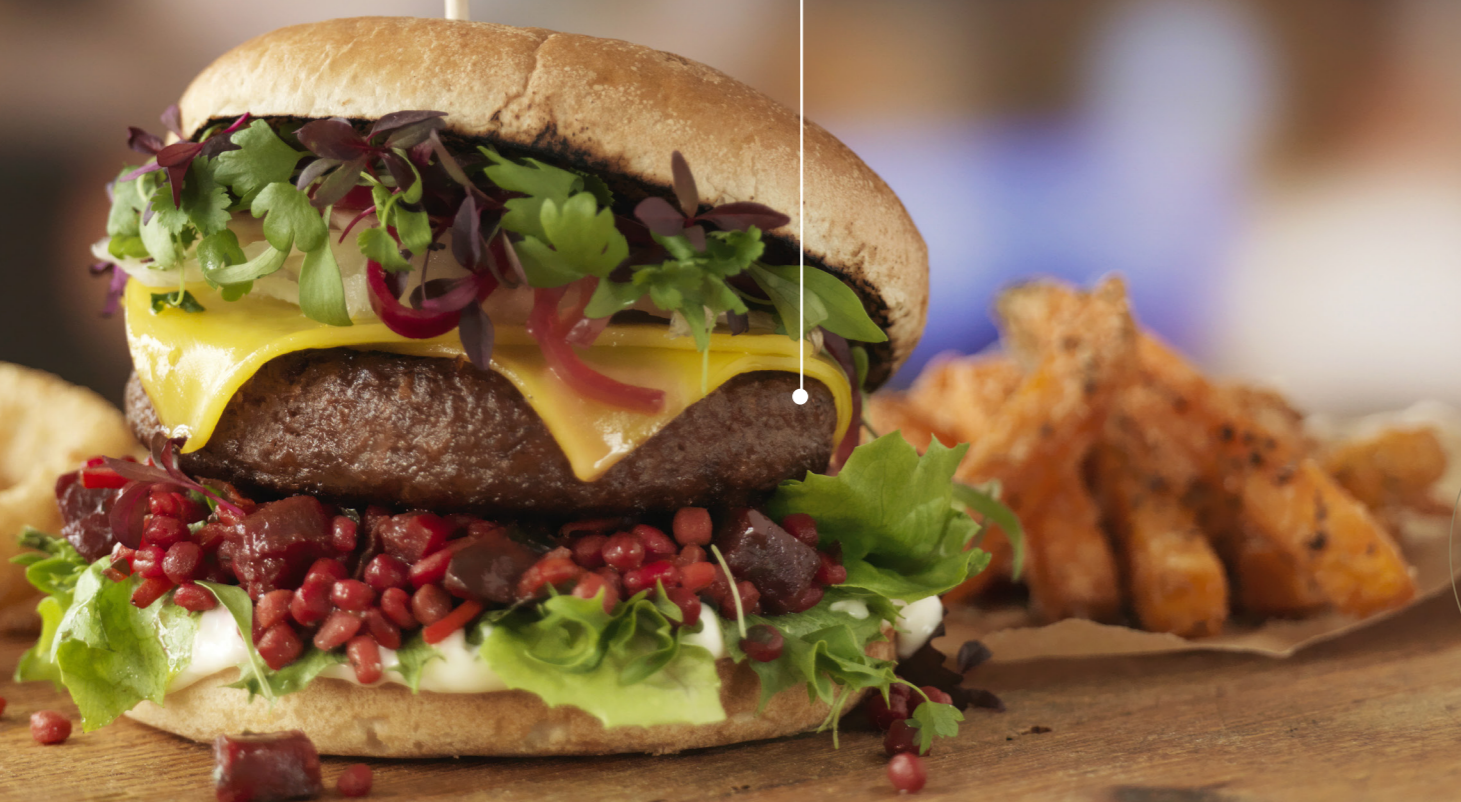
Beyond Meat The Beyond Burger V VE A 127622 40 x 113g