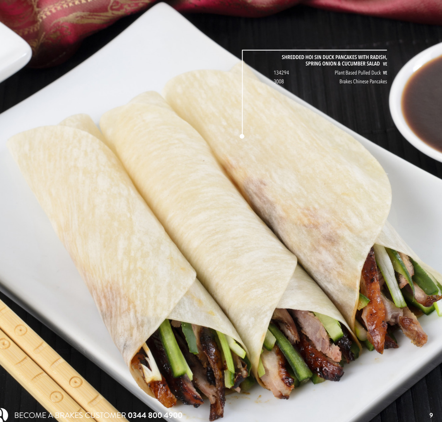
SHREDDED HOI SIN DUCK PANCAKES WITH RADISH, SPRING ONION & CUCUMBER SALAD VE 134294 3008 Plant Based Pulled Duck VE Brakes Chinese Pancakes

Ideal for larger numbers of visitors, a well ranged finger buffet is a caterers opportunity to showcase product vibrancy, colour and taste. Delight delegates with easy to eat food inspired by British favourites and international flavours.